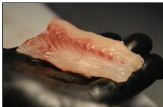
Taking a fish sample.