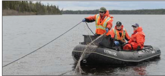
Setting a gillnet in the Romaine river.

The calculation of the safe number of meals per month for each consumption category was based on the following: a 230-g portion of fish (before cooking), a body weight of 60 kg, a mean total Hg level in fish of a standardized length specific to each species, and regular consumption throughout the year. These recommendations are therefore very conservative.