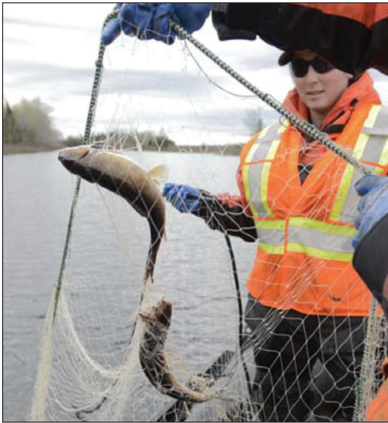
Far left: Gillnet fishing.