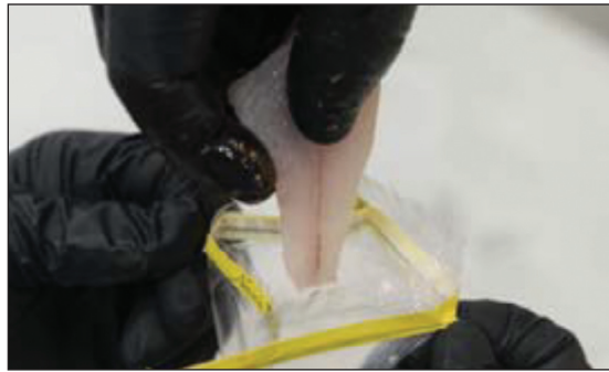
Putting the fish sample in a Whirl- Pak-type bag.